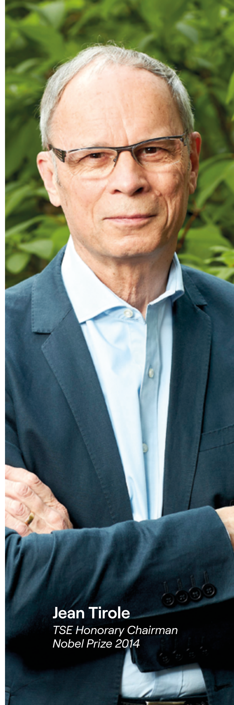
Jean Tirole TSE Honorary Chairman Nobel Prize 2014